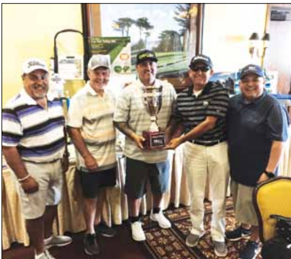
CJ Concrete Construction is awarded the prestigious Mayors Cup.