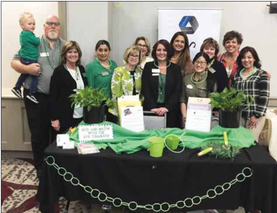
Donning their green gear, Santa Fe Springs Chamber staff, members, ambassadors and board proudly posing at the SFS Chamber booth.