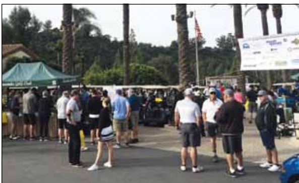
Best networking around!