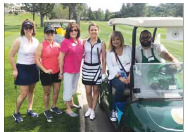
Board members visit golfers on the course.