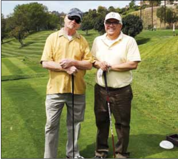
Second place winners Secure Transportation (I guess the others took too long at the taco truck.)