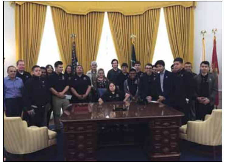
Students and mentors visited the "oval office."