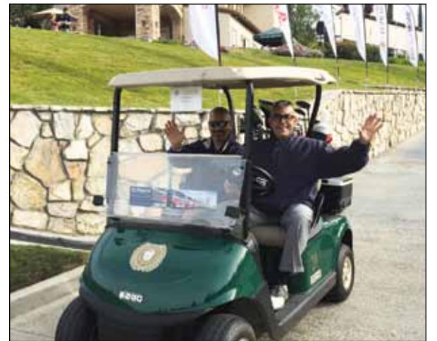
Greetings from Maverick Natural Resources.