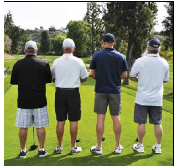
The better side of Serv-Wel Disposal.