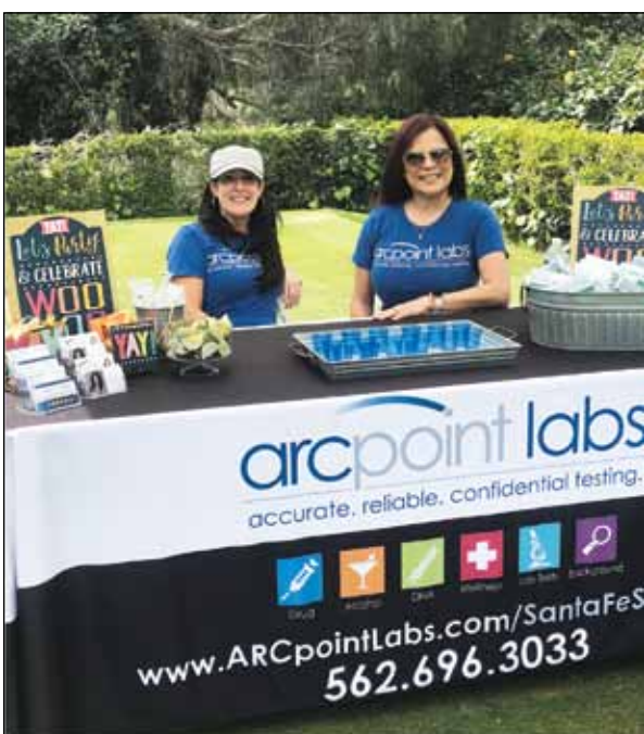
ARCpoint Labs of Santa Fe Springs offers tequila shots or a breathalyzer.