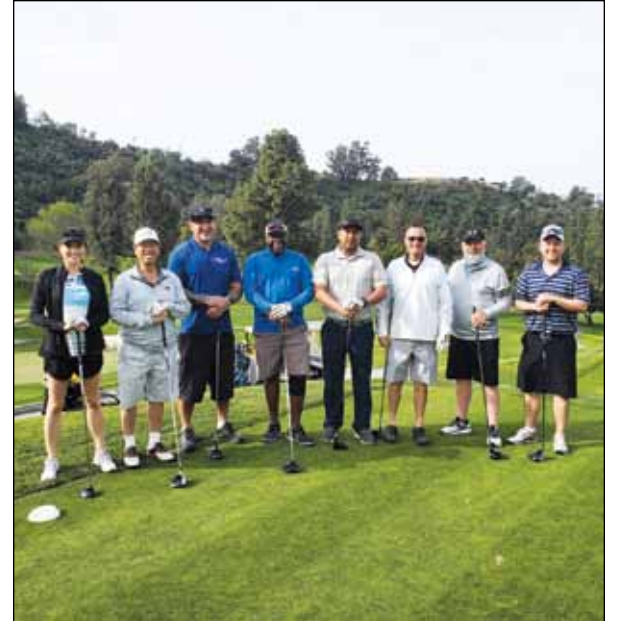
Many thanks to Gold Sponsor Baker Hughes.