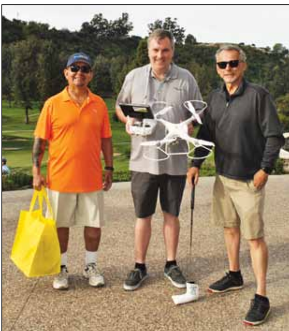
Getting ready to send up the drone.

And a very special shout out to the committee and volunteers who make this tournament so much fun. We truly couldn't do it without you!