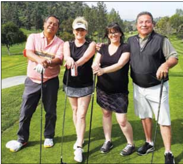
Third place winners Redlands Ford