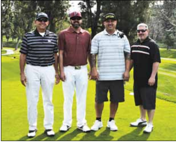
First place winners CJ Concrete Construction