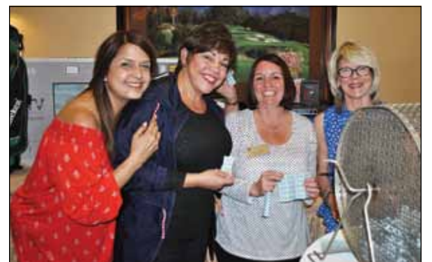
A warm thank you to all our volunteers.